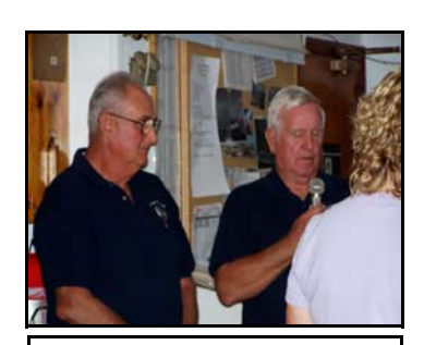
Member of race committee thanks Art